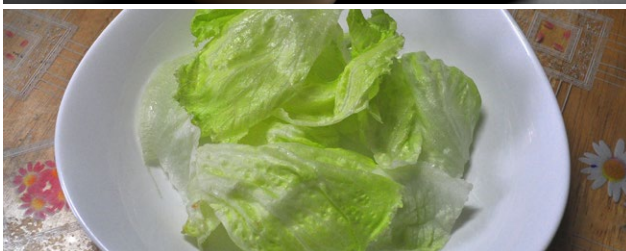
greenery (usually lettuce)