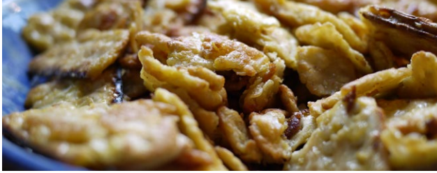
matzo (bread without yeast)