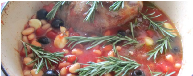
bone of lamb