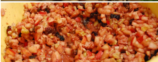
charoset (a paste made of apples, nuts, cinnamon and wine)