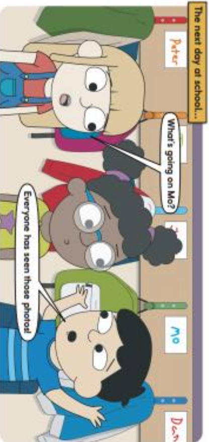
The next day at school...