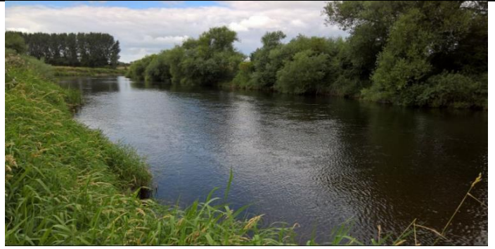
8. River Severn (the longest river in the UK)