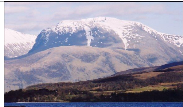
5. Ben Nevis (the highest mountain in the UK)