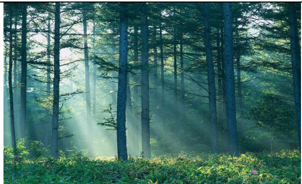
6. Forest of Dean, Gloucestershire