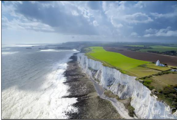
9. The White Cliffs of Dover