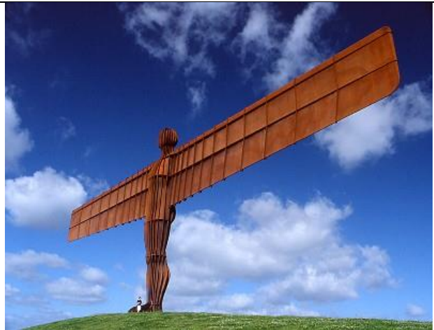
2. The Angel of the North, Gateshead