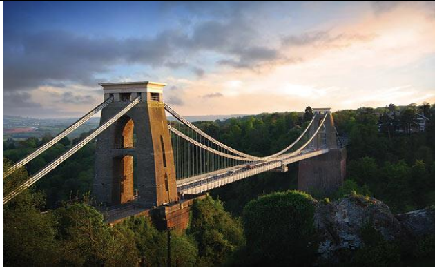
7. Clifton suspension bridge, Bristol