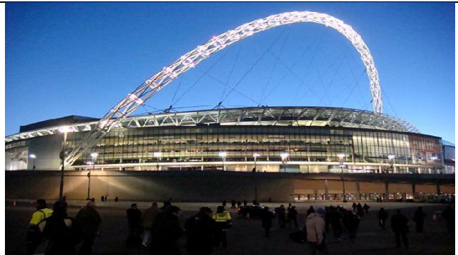
4. Wembley Stadium, London