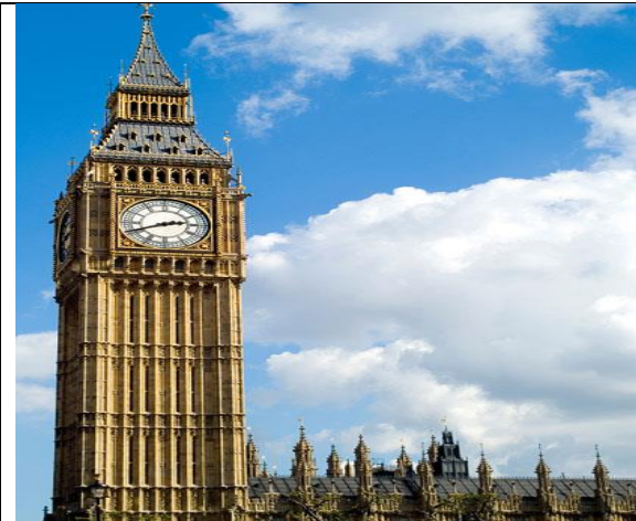
1. Big Ben and the Houses of Parliament, London