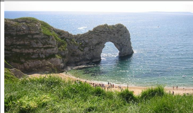
3. Durdle Door on the Jurassic Coast, Dorset