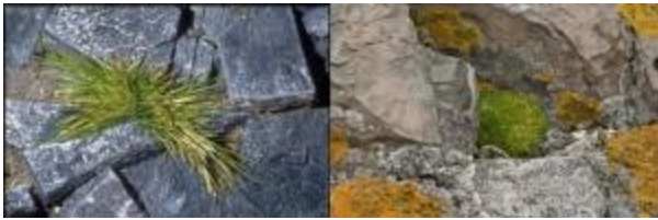
Antarctic hair grass and Antarctic pearlwort.

There are only two native vascular plants in Antarctica: Antarctic hair grass and Antarctic pearlwort. These species are found in small clumps near the shore of the west coast of the Antarctic Peninsula, where temperatures are milder and there is more precipitation.