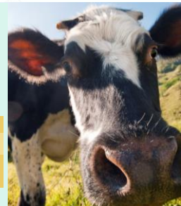
Photo courtesy of iStockphoto.com. Licensed under the Creative Commons license.