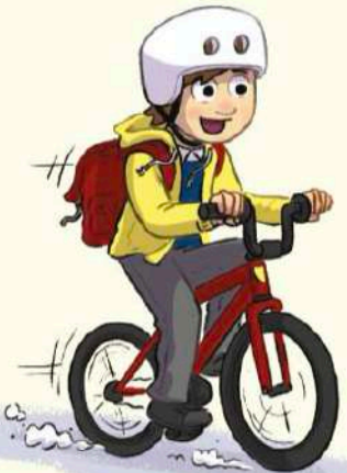
Hop on your wheels.