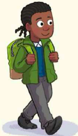
Get on your feet.