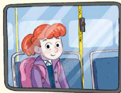
Catch the bus.

Trees get rid of some of the gases from the air.