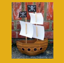
Design and make a boat.